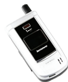
Lenovo P930 Symbian OS